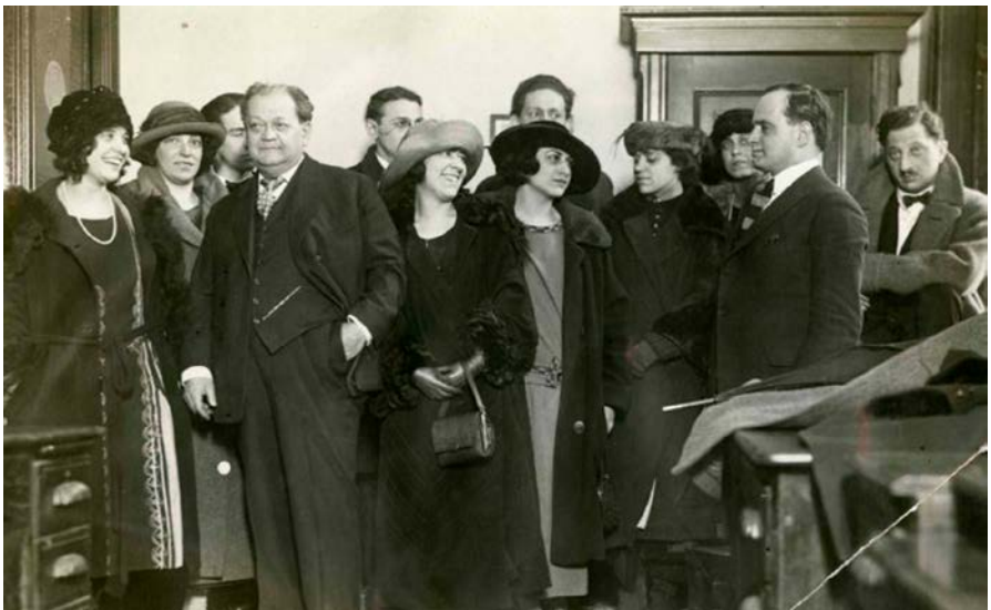
New York cast of God of Vengeance at the police station, Jewish Studies Columbia .

Jews do not need to clear themselves before anyone. They are as good and as bad as any race. I see no reason why a Jewish writer should not bring out the bad or good traits. I think that the apologetic writer, who tries to place Jews in a false, even though white light, does them more harm than good in the eyes of the Gentiles. I have written so many Jewish characters who are good and noble, that I cannot now, when writing of a 'bad' one, make an exception and say that he is a Gentile."