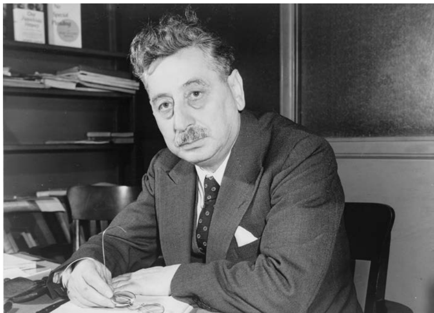
Sholem Asch, Polish-born American novelist, dramatist, and essayist.